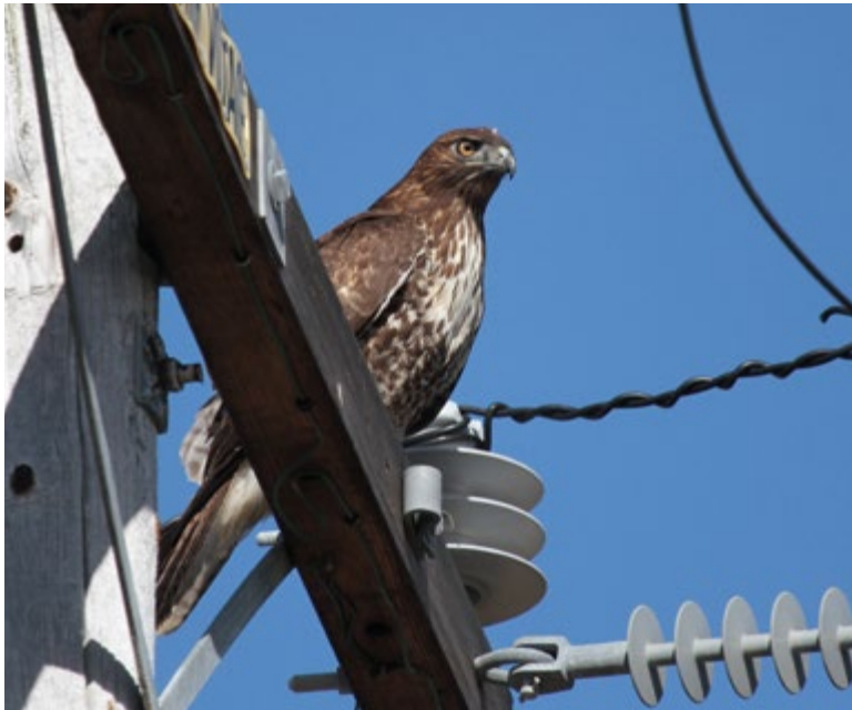
Red-tailed Hawk

The highlight for me was a hunting Prairie Falcon, only the second time I've seen that species here on the coast. One group also saw a Merlin streak past them, making this a four-Falcon day. At least three Ferruginous Hawks put on a show at one location, parading back and forth in full view.