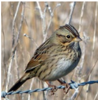
Lincoln's Sparrow