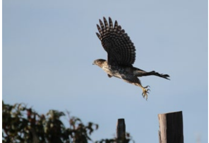
Cooper's Hawk, chased off its perch by a dive-bombing American Kestrel.

This is always a good trip, but this year was extraordinary. After two days of rain, the skies cleared, the air warmed up and the raptors put on a show. At some stops we had a dozen (or more) hawks in sight at one time. Red-tailed Hawks were of course the most abundant; we tried to keep track, but after about 50 hawks we kind of lost count. American Kestrels were also plentiful, and aggressive - several times we watched them harassing Red-tails, and one even drove off a Cooper's Hawk.