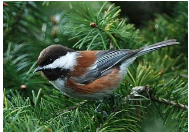
Chestnut-backed Chickadee

This will be the 118th annual Christmas Bird Count conducted by the National Audubon Society. There are now several thousand Count circles across the Western Hemisphere, and two of them are right here on the Mendocino coast. Teams of birders go out and count every bird they can find and identify within a circle 15 miles in diameter, within a 24-hour period. In addition, we keep track of unusual sightings during "Count Week" - three days before and three days after the actual Count Day. If you see or hear any unusual birds during the Count Week periods, please report them on Mendobirds (Yahoo! group), or on our Facebook page, or to the Compiler. All Counts