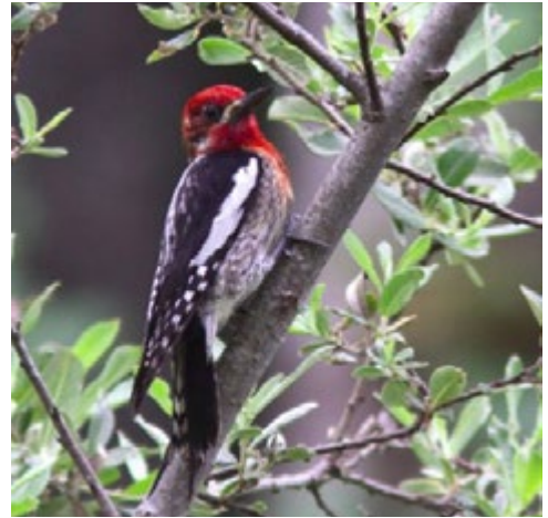
Red-breasted Sapsucker