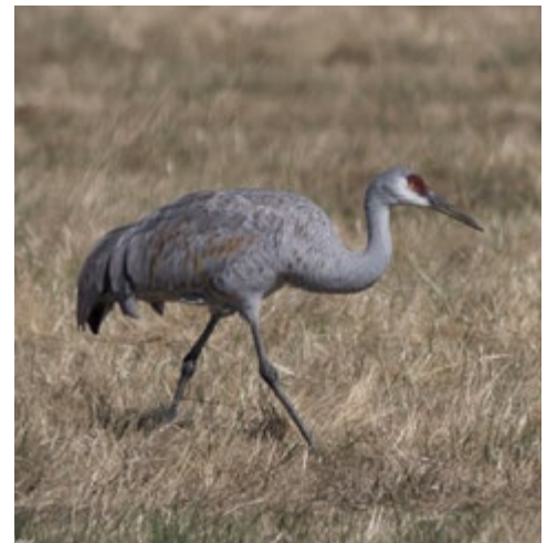
Sandhill Crane by Ron LeValley

Sign up in advance to receive details and notifications if weather forces us to change plans: tbray@mcn.org or text (707) 734-0791