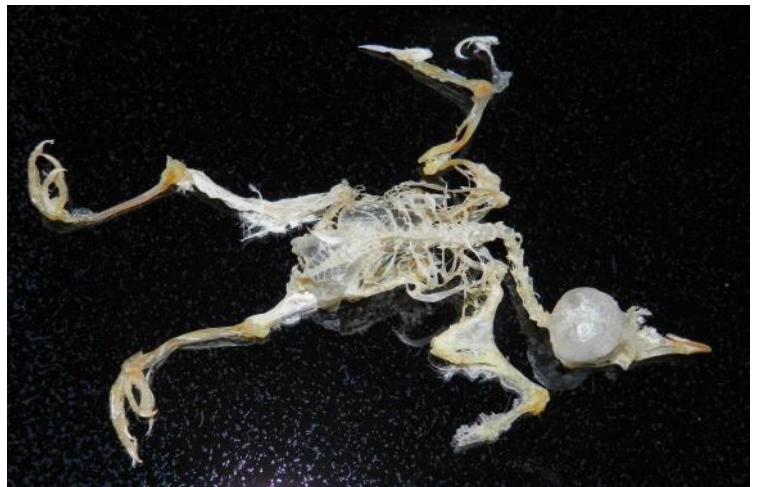
Hermit Thrush skeleton

In the swamp in secluded recesses, A shy and hidden bird is warbling a song. Solitary the thrush, The hermit withdrawn to himself, avoiding the settlements, Sings by himself a song. Song of the bleeding throat, Death's outlet song of life, (for well dear brother I know, If thou wast not granted to sing thou would'st surely die.)