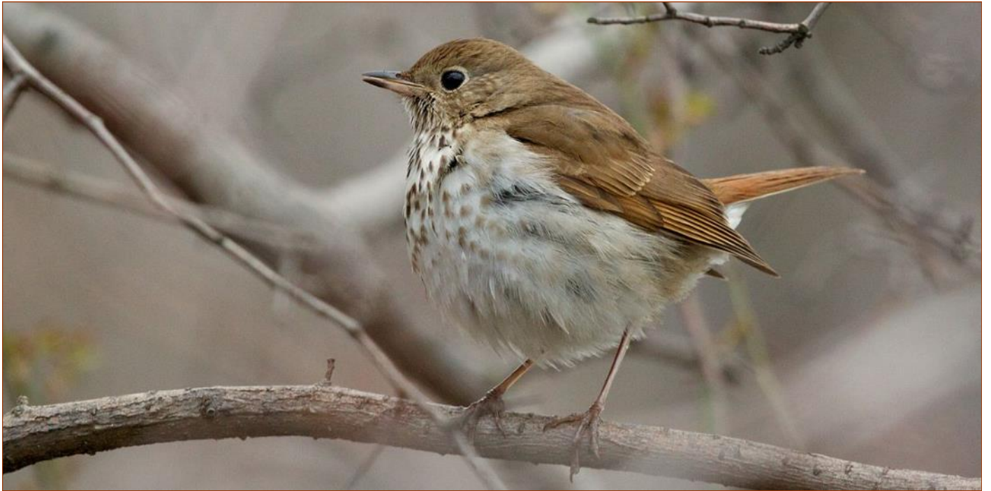
Hermit Thrush

This mild winter gave me the opportunity to clear five tree stumps from my gully garden. I hacked away at them over a period of two months, removed the wood, filled in the holes, and raked over the soil. This coastal black sandy loam works easily. Old-time farmers would have called it a one-horse soil – meaning they needed to hitch only one horse, not two or three, to the plow. When I grab a handful and squeeze, it holds together then crumbles easily when I rub it between my hands; it is nicely friable. I think about what I am raking. Mother earth consists of sand, silt and clay. Air and moisture support a multitude of organic matter, both living and decaying.