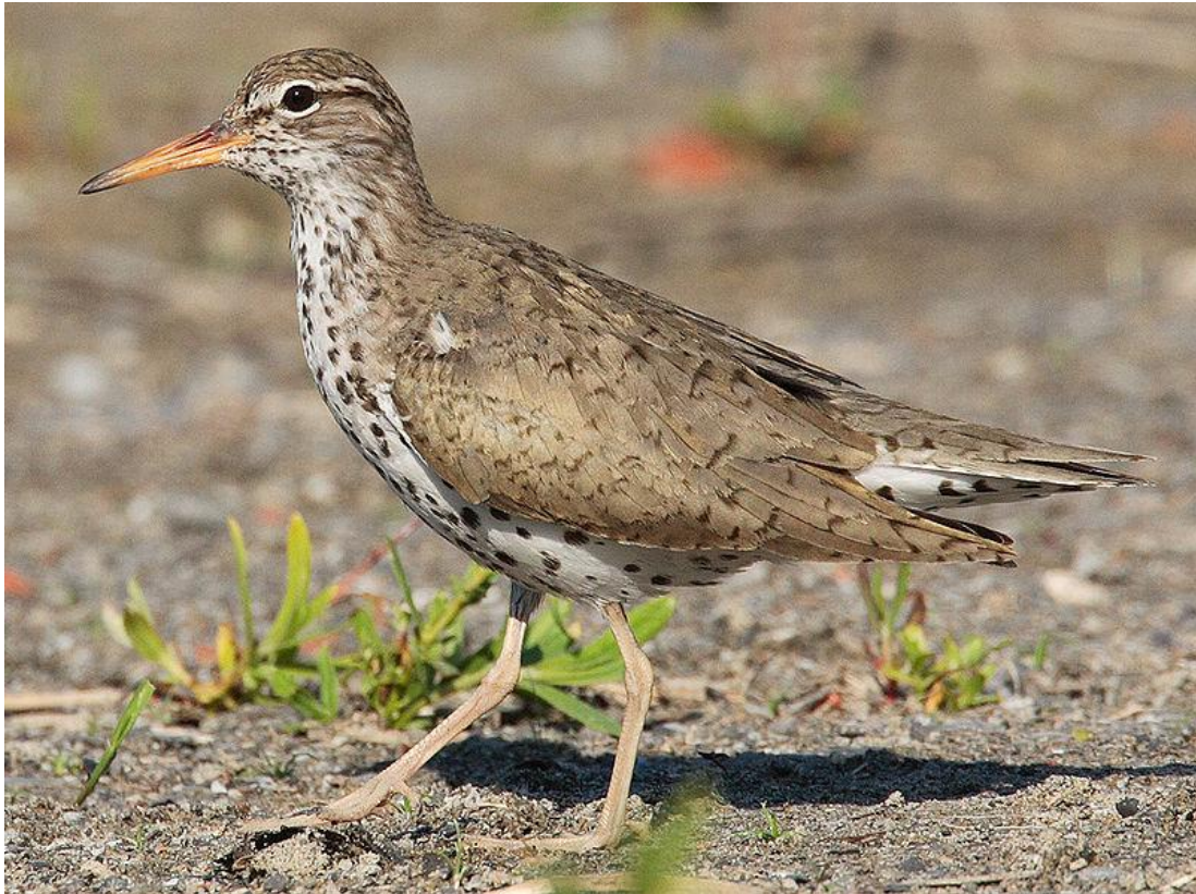
Spotted Sandpiper photo from Wikimedia Commons

In another century and on a different continent, my mother would have called the Spotted Sandpiper a "forward hussy" even though Arthur Cleveland Bent called it, "one of the prettiest and delicate, and trim of the shorebirds." The rapid swaying up and down of the hinder part of the body contrasts with the plover-like hitching movement or bob, as if hiccupping, of the somewhat similar Solitary Sandpiper.