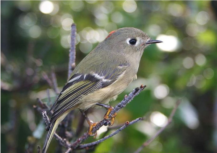
Ruby-crowned Kinglet

The name, Ruby-crowned Kinglet, is a bit misleading since only the male wears the crown and he rarely flashes the ruby-red crest, except during courtship in the mountains. Otherwise, these tiny, four-inch birds could be considered rather drab. They have a small bill, buffy underparts, dark wings and a short, dark tail. They have two white wing-bars and large, dark eyes outlined by a white ring that is broken at the top. A most distinguishing characteristic is its nervous wing flicking.