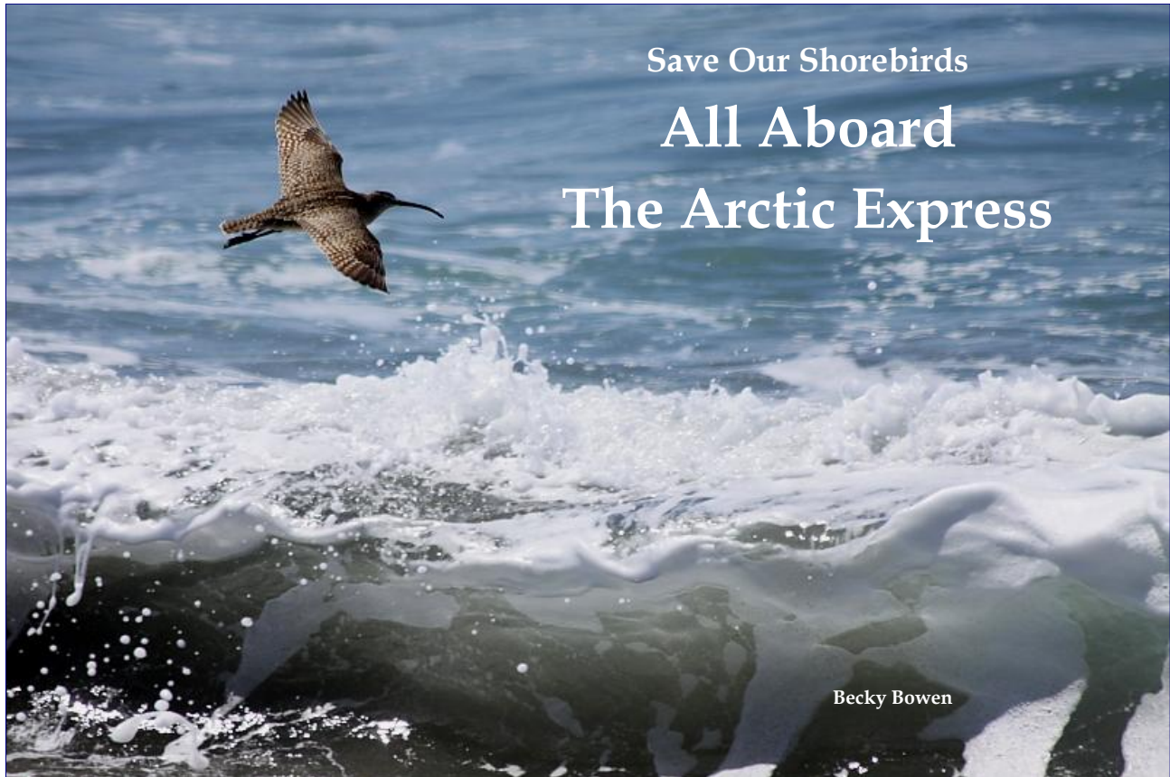
A lone Whimbrel on the move at Ten Mile Beach. In MacKerricher State Park, headed north to summer nesting area in the Arctic tundra.

If you are a shorebird, the train has left the station. For many shorebirds, May brings a mad rush to the Arctic tundra where breeding, nesting and chick-raising are quickly accomplished when food is plentiful and predators are not—and the summer days are long and warm.