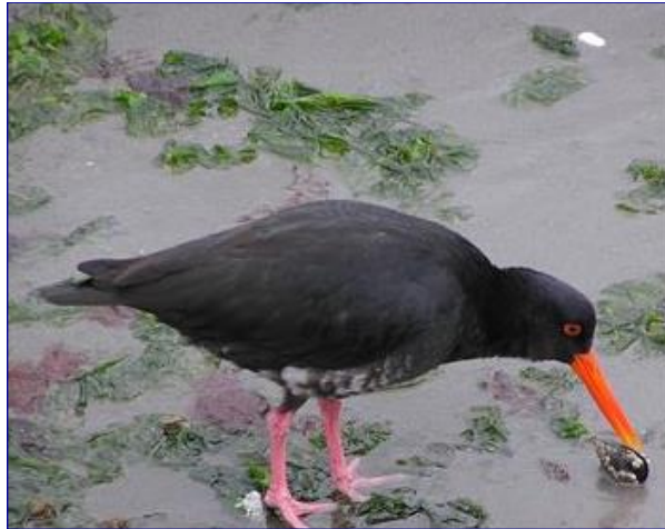
Variable Oystercatcher