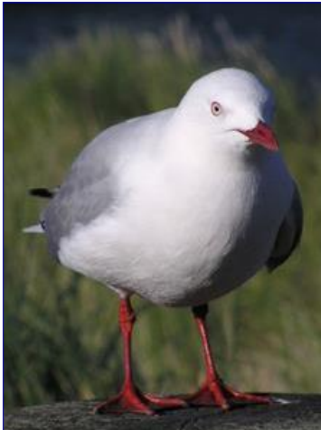
Red-billed Gull

Join me as I recreate my recent trip to New Zealand and Australia. First, let us visit New Zealand where the volcanic North Island and tectonic South Island provide widely different environments. I should confess that these are not my photographs but much better ones taken by local professionals. Here are some of the birds we saw on the North Island.