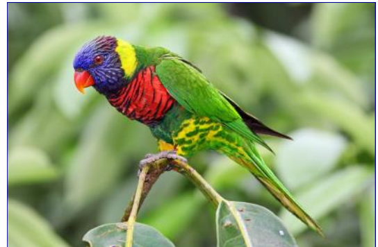
Rainbow Lorikeet

More birds enthralled us. In Milford Sound, a fiord on the west coast of South Island, the Yellow-nosed Mollymawks thrilled us. They are albatrosses. We also saw New Zealand Scaup in Queenstown as well as New Zealand Teal on Lake Wakatipu. We experienced a great deal of autumnal rain, but the sun shone brightly on Mount Cook when we flew to the source of the Franz Josef Glacier in a whirlybird helicopter. Ah, the joys of flight in a land of transient waterfalls and rainbows.