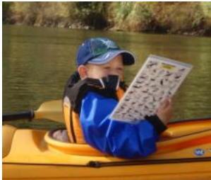
Liquid Fusion Kayaking