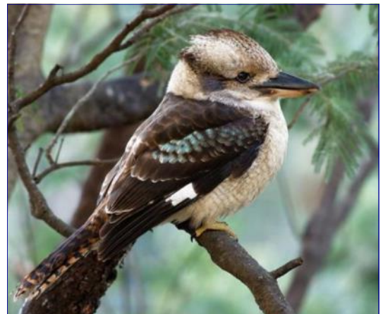
Laughing Kookaburra

Our fourth jet of the trip whisked us from Wellington to Brisbane, Australia. Flame trees line the broad streets of Ormiston, a Brisbane suburb where we stayed with my niece for a week. Rainbow Lorikeets feed in the trees. A belt of eucalyptus trees enable koala bears to roam among the houses. Some of these supposedly cute