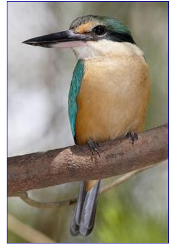
Sacred Kingfisher

On the mainland, as South Islanders call their home, we found the reintroduced Black Swan; a relative of the nocturnal Kiwi called the Weka; and the curious mountain parrot called Kea.