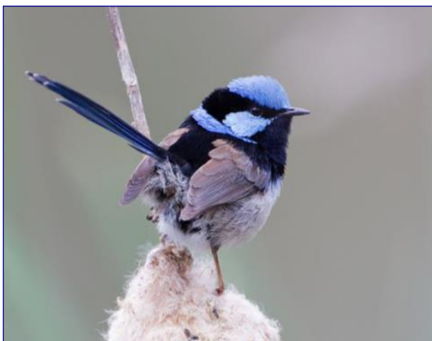
Blue Wren

Many birds were similar to common birds here, many differed considerably, but the bird I most wanted to see was the Blue Wren also known as the Super Fairy Wren. But I shall have to make another trip down under to see one.