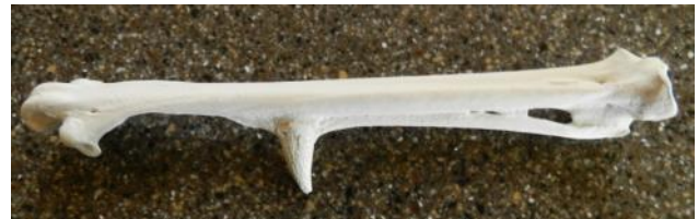
Wild Turkey lower leg bone with fighting spur

I shall give thanks for living in this beautiful and prolific place. Wild Turkey was not on the menu in 1621 when the Plymouth colonists and Wampanoag Indians shared their autumn harvest feast; nevertheless I hope you enjoy your Thanksgiving, with or without a slice of the silly and vain bird.