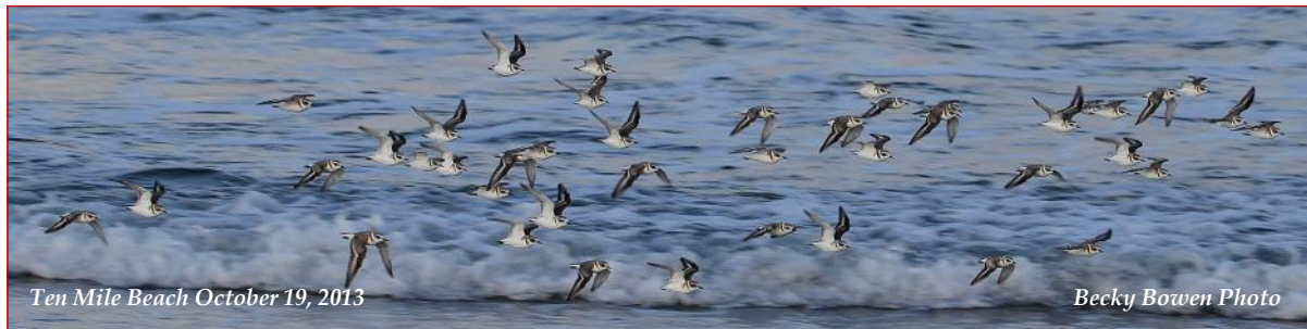
Ten Mile Beach October 19, 2013