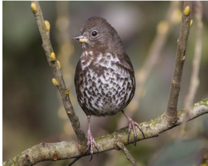
Fox Sparrow – taken at the mouth of the Elk River in Humboldt County

Fox Sparrows are brown with heavily-streaked breasts of triangular markings that merge to a central spot. The legs are pale.