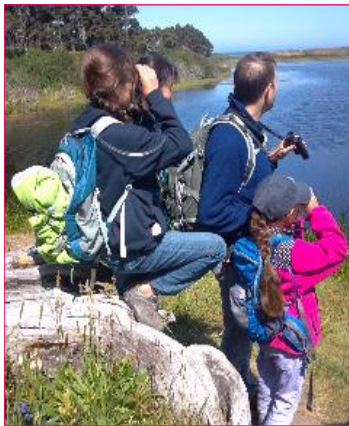
MCAS Family Birdwalks will begin spring, 2014.

Our young birders have come to know our education team as "The Bird Ladies." They shout it out of school bus windows or in a tumble of words and hugs at the grocery store or on the street. On a recent MCAS Education field trip along the Casper Uplands trail, I watched as each child spotted the Osprey nest. There is just nothing like that light in the eyes of the young when they are successful. A girl name Erwin (with eyes sparkling) informed me after the Caspar birdwalk that Acorn Woodpeckers could store 400 acorns in a granary tree. She heard it during one of Pam Huntley's radio spots on KZYY.