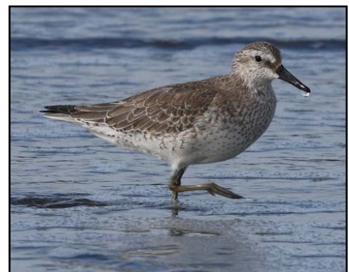
This Red Knot in non-breeding plumage was observed on three SOS surveys in November. Please visit us on facebook to see what we are observing on year-round surveys.