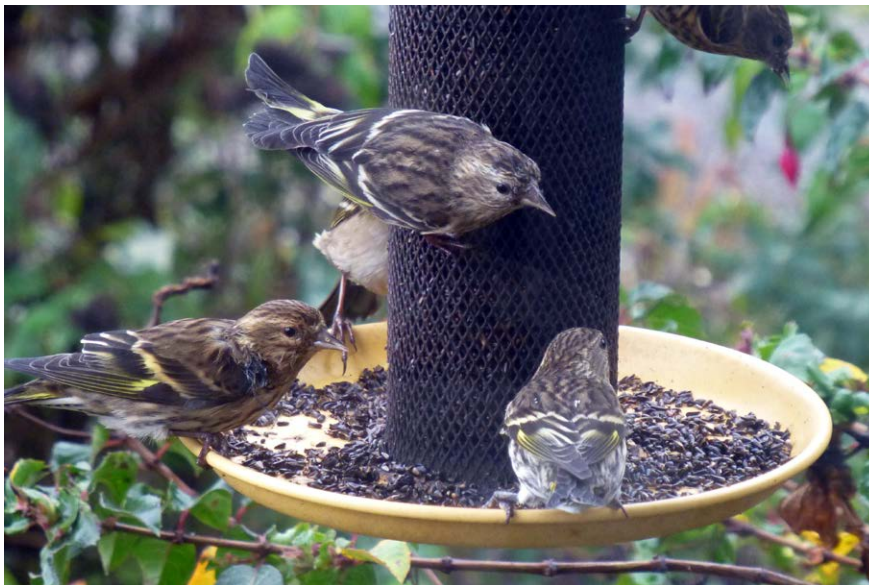
Pine Siskins at a feeder.

MONDAY, DECEMBER 21 AT 7:00 P.M. VIA ZOOM