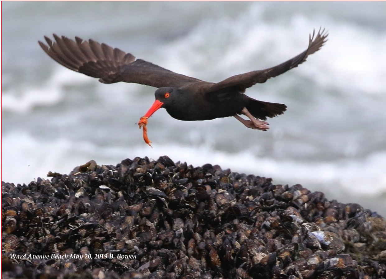
Ward Avenue Beach May 20, 2019 B. Bowen