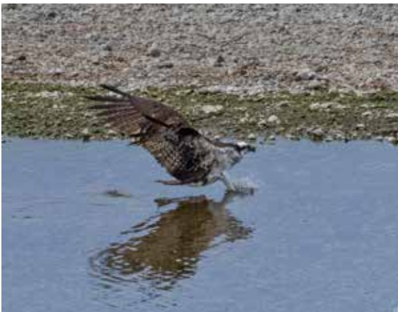
Photo of fishing Osprey

The Gualala River estuary provides an especially important freshwater environment for young steelhead, a small Coho salmon population, the Gualala roach and other fish. Red-legged frogs, Harbor seals, river otters, Osprey, Bald Eagles, Green Heron, wintering ducks and other birds are among the many wildlife species that may be spotted along the river.