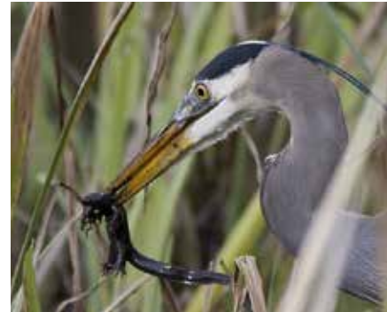
Blue Heron

Now is the time to start planning for our April field trip to see the birds of Arcata Marsh and Humboldt Bay National Wildlife Refuge. Tentative plans are to leave Fort Bragg on the morning of Saturday, April 11, and carpool to the Arcata Marsh, where we can observe shorebirds during the afternoon high tide.