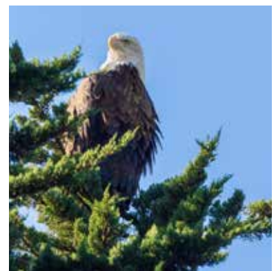
Bald Eagle at Mill Bend by Craig Tooley