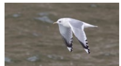
Mew gull

Participate in this year's Global Big Day May 5, 2018. See page 3.