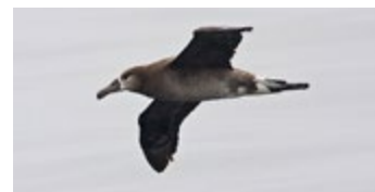
Black-footed Albatross