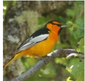
Bullock's Oriole by Ron LeValley

We usually bird the area around the bridge first, then go to the beach and work our way back, if the wind is blowing in. Good variety of waterfowl, gulls and seabirds from the beach, and songbirds along the road (Wilson's and Orange-crowned Warblers, Warbling Vireo, Black-headed Grosbeak and Bullock's Oriole).