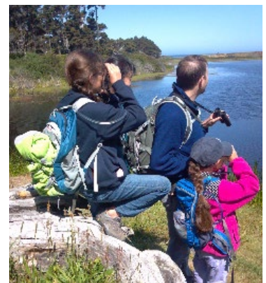
Education Spotlight by Dave Jensen. See page 2.