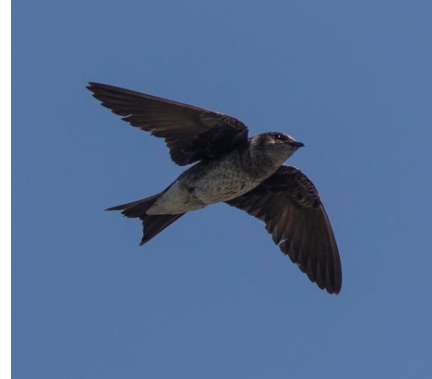
Purple Martin by Ron LeValley

Meet at the bridge on Philo-Greenwood Road. We will bird from the bridge and nearby areas, then go into the park and walk a loop trail. Swallows and Purple Martins, Black-headed Grosbeaks, and Black-throated Gray Warblers are regularly seen; sometimes Western Tanager, Hermit Warbler, and Green Heron. Barred Owls roost in the campground and are sometimes heard calling even in daytime. Please bring water and a picnic lunch.