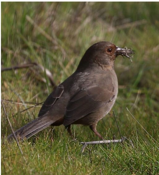
California Towhee

Audubon's Christmas Bird Count is the largest and longest-running citizen-science effort in the world. Started by Frank Chapman in 1900, it quickly became a popular alternative to the "side hunt" of the 19th century. Last year almost eighty thousand people participated in the Count.