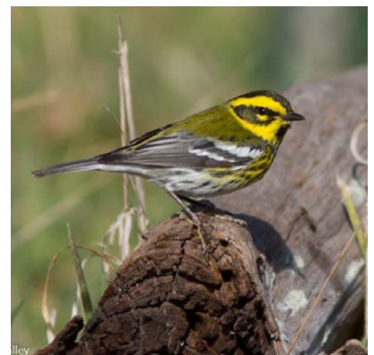
Cascadian Warbler? (Currently Townsend's). See page 3 for more.