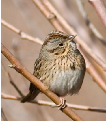
Lincoln's Sparrow