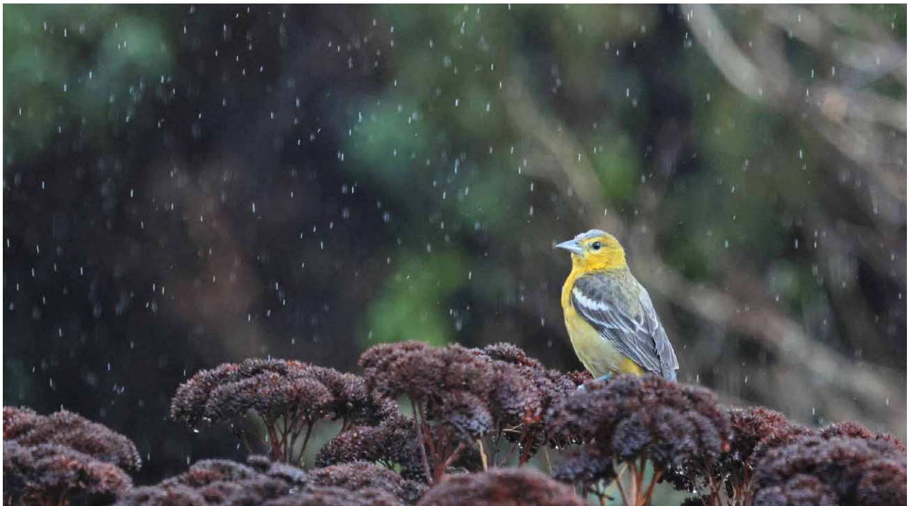
Baltimore Oriole