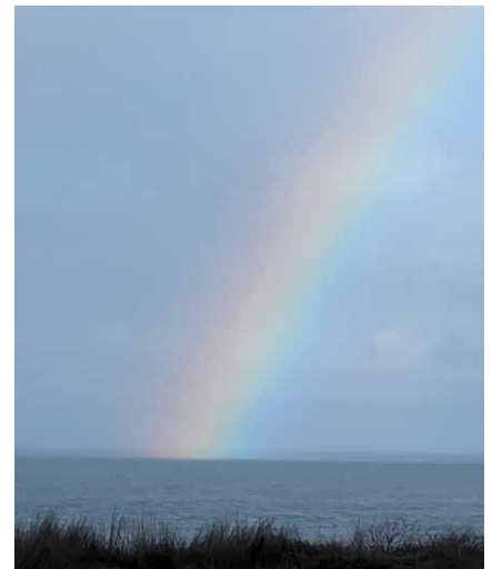
Recent rains made for beautiful rainbows over the ocean.