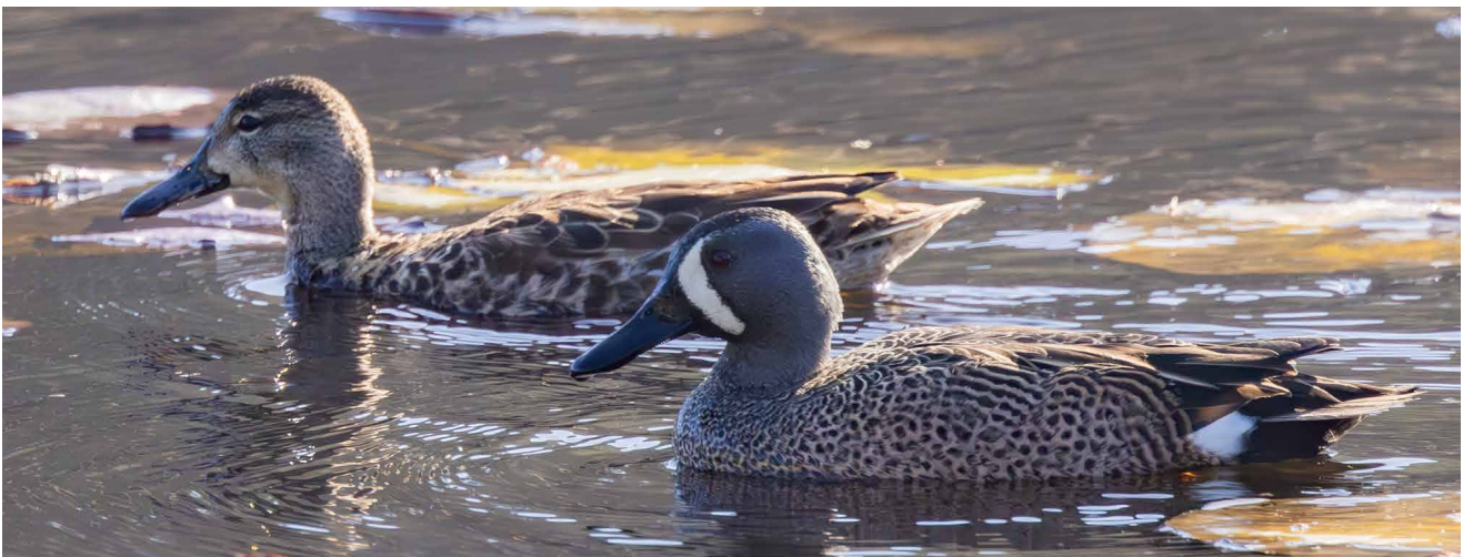
Blue-winged Teal

For a more complete list, see the eBird Trip Report: https://ebird.org/tripreport/173997