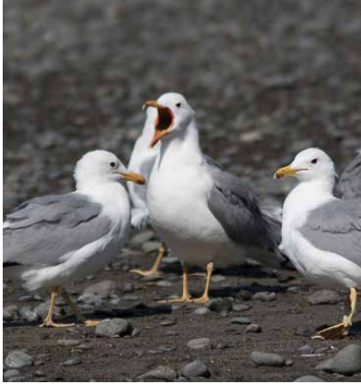
California Gull