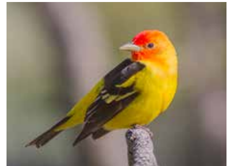
Western Tanager

Species expected include Osprey, Pileated Woodpecker, White-headed Woodpecker, Black-backed Woodpecker, Williamson's Sapsucker, Vaux's Swift, Common Nighthawk, Bufflehead, Gray Jay, Brown Creeper, American Dipper, Mountain Bluebird, Yellow Warbler, Western Tanager and Cassin's Finch. Possibles include Sooty Grouse, Northern Pygmy-Owl, Cassin's Vireo, Pygmy Nuthatch, Green-tailed Towhee and Evening Grosbeak.