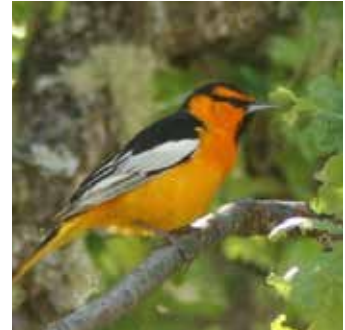
Bullock's Oriole

SUNDAY, MAY 13, 2018 7:00 A.M. - 5:00 P.M.