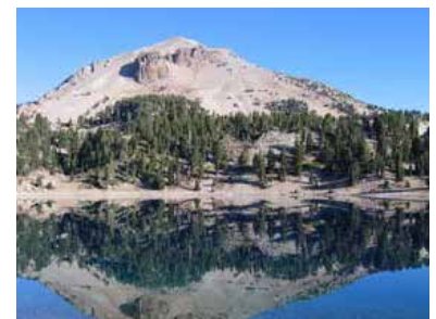
Wintu Audubon's Annual Lassen Volcanic National Park Campout See page 5.