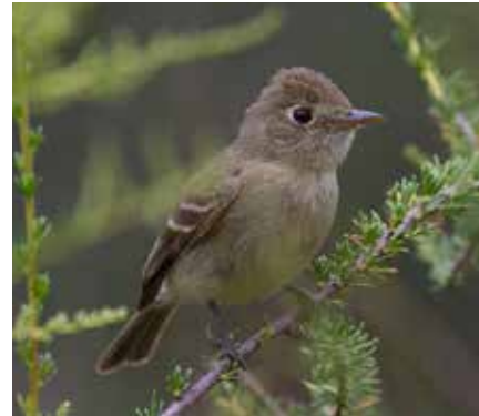
Pacific Slope Flycatcher by Ron LeValley

The bridge over the Navarro River provided a splendid view of many Swallows and one beautiful singing male Black-headed Grosbeak, among many other birds. Working our way into the woods, we heard but could not quite see singing Hermit and Black-throated Gray Warblers and Western Tanagers. We did eventually get good views of Pacific-slope Flycatchers and Wilson's Warblers. Purple Martins called occasionally and were briefly spotted swooping through the treetops, along with a lone Vaux's Swift. Out in the meadow, along the river bank, we were treated to the sight of Northern Rough-winged Swallows flying into their tunnels. Roger Adamson spotted a distant soaring raptor that proved to be a Golden Eagle, barely identified before it disappeared into the distance. Altogether we saw or heard 48 species of birds.