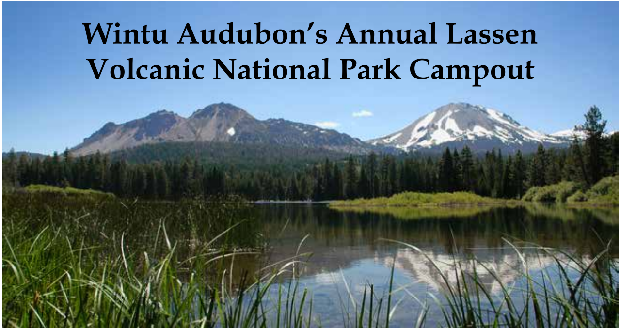
Manzanita Lake, Lassen Volcanic National Park

We have enjoyed the birding and camping at the Lost Creek Group Campground for several years, so we are scheduling this event again this year in conjunction with Altacal Audubon. Group Camp sites #4 & 5 have been reserved for the nights of Friday, July 27 and Saturday, July 28. We are inviting the Redwood Region, Peregrine, Mendocino, Plumas and Redbud Chapters to join us.