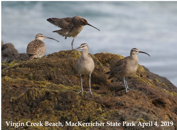
Virgin Creek Beach, MacKerricher State Park April 4, 2019

Whimbrels are a shorebird of least concern according to the International Union for Conservation of Nature. There is a total estimated global population of 1 to 2.3 million but the population trend is decreasing, in large part because of habitat changes in the delicate subarctic nesting areas. Wintering grounds are on six continents. So Whimbrels (there are seven subspecies) have the widest global range of any curlews.