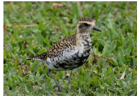
Pacific Golden-Plover by Ron LeValley

We will walk out the "enchanted trail" through snag-forest and understory habitat, then head out to the beach to find shorebirds returning from their Arctic breeding grounds. On their southward migration, many birds linger on this beach and some are still in breeding plumage. This is the best time to find birds like Ruddy Turnstone or Red Knot, Pacific Golden-Plover, the rare American Golden-Plover and (possibly) the threatened Western Snowy Plover.