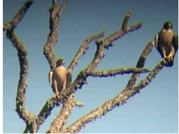
Peregrine Falcons spotted on 10/9

We decided to try going over 253 to Ukiah and birding the wastewater treatment plant. That turned out to be a good call – there was actually very little smoke down on the valley floor, and the birding was good. Ryan Keiffer was just finishing up his tour as we got there, and he pointed us to some good birds, including a Blue-winged Teal. A pair of adult Peregrine Falcons put on a nice show nearby.