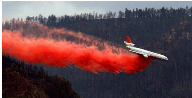
A DC-10 tanker jet drops a load of fire retardant.

It was certainly the craziest Audubon field trip I've ever been involved with, and I am grateful to the participants for making a good day of it, in spite of our anxiety over the events happening to the north and south of us.