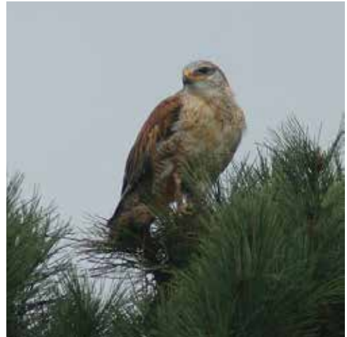
Ferruginous Hawk