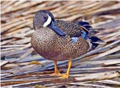
Blue-winged Teal

After lunch we tried for Rock Wren at Lake Mendocino, but we found no Wrens and were distracted by the spectacular view of Cal Fire borate-bombing the Redwood fire. It was a surreal experience.