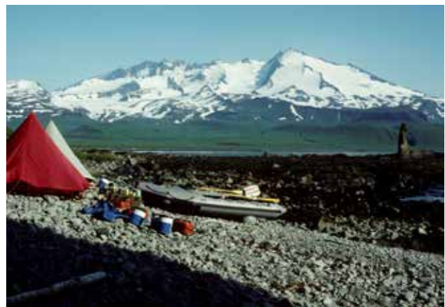
Field camp on Kigul Island with Mount Vsevidof on Umnak Island in the background.

For two summers Doug was part of a team of four biologists surveying the Eastern Aleutians (the Fox Islands) by Zodiac. Their mission was to accurately estimate the distribution and abundance of nesting seabirds in order to prioritize acquisition of islands for incorporation into the Aleutian National Wildlife Refuge. They were also to identify large seabird colonies so the areas surrounding them could be excluded from planned offshore oil leases. Together, they estimated almost 2 million seabirds nested there, including three of the four largest colonies of Tufted Puffins, representing more than one third of the world population.