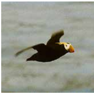
Tufted Puffin

-fic Ocean to the south. These islands, extending more than 1,200 miles, are home to many large colonies of seabirds, nearly all of which are protected as part of the Alaska Maritime National Wildlife Refuge and the Aleutian Islands Wilderness.