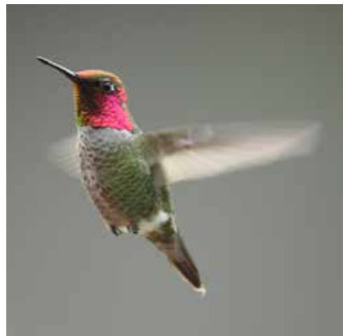
Anna's Hummingbird

Please hold these dates for our Audubon Christmas Bird Counts: