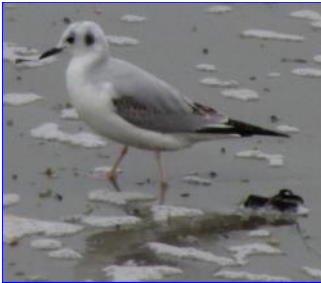
Rock Sandpiper (above) and Bonaparte’s Gull on Fort Bragg CBC, p. 2