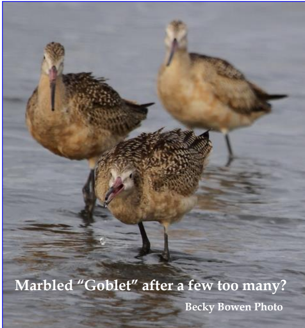
Marbled "Goblet" after a few too many?