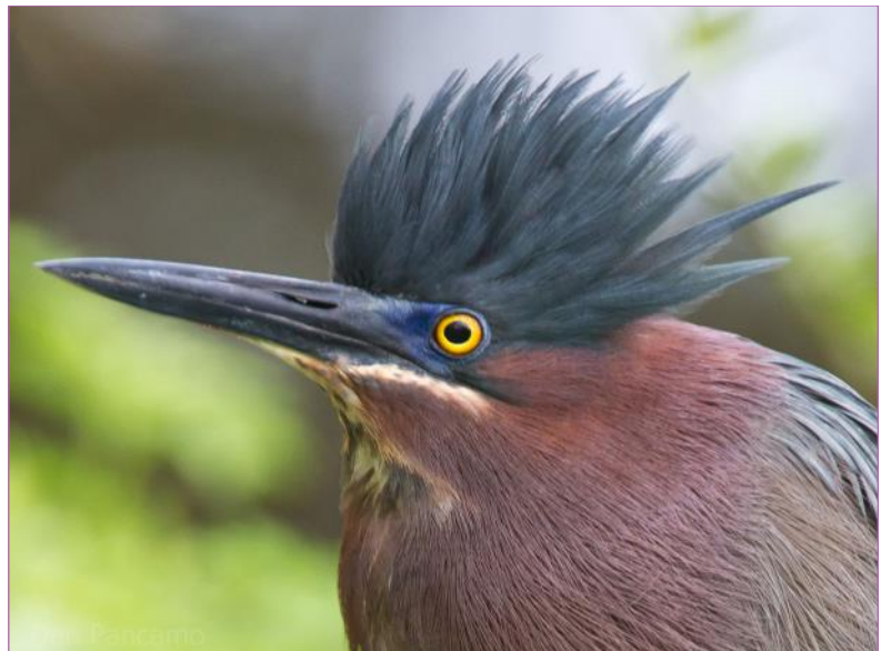
Green Heron

Unlike other herons, they nest and roost singly in trees. Crow sized, Green Herons appear dark overall without contrasting markings. Note their stocky shape, short broad wings, and short legs. Sibley describes their wing beats as deep and snappy. Their habit of often briefly unfolding their neck during flight will aid your identification. The name, like a lot of other bird names, puzzles me because the dark