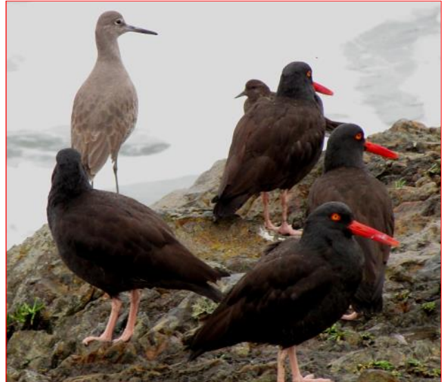
Willet, Black Turnstone, and Black Oystercatchers at Fort Bragg Christmas Bird Count.

The weather was adverse, to put it mildly; rain began around 4:30 AM and continued all day, with a short break mid-morning, and intensifying in the afternoon. Everyone who went out in that and persevered in finding birds deserves effusive praise, and maybe counseling! It was a tough day to be outside and an even tougher day to find and identify birds, with wet optics, watery eyes, and runny noses. Yet the dining hall at the Caspar Community Center at day's end was filled with laughter and good cheer as we traded stories of nearly-birdless walks and tallied up what we did find.