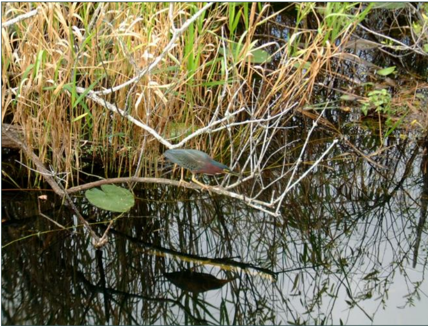
Green Heron