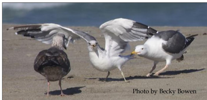
California Gull (center) gets a territorial tail-yank from a Western Gull on Virgin Creek Beach in Mackerricher State Park. The photograph was taken in September, 2010.

California Gulls nest on islands in fresh water or alkaline lakes. They make nests of sticks, weeds, rubbish and feathers. The pair incubates three darkly blotched eggs for 25 days and both feed the young.