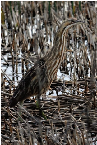
American Bittern