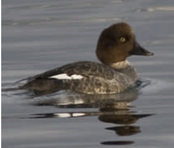
Female Common Goldeneye

Pam's radio spots can be heard on KZYX Monday at 5:50 pm and Friday at 7:50 am.