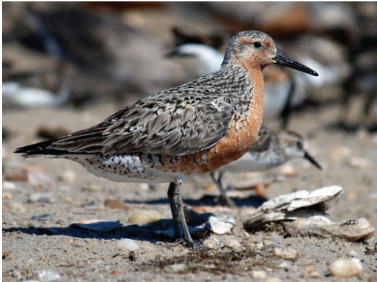
Red Knot breeding plumage.

In 1028 A.D., King Canute of England, Denmark, Norway, and parts of Sweden sat on his throne in the tidewaters of the Thames at Westminster and watched the river rise about his ankles to prove he could not stem the tides. In 1758, Linnaeus allocated the species name, canutus , to the Red Knot because he likened their habit of foraging along the tide line to Canute's behavior. Knot is a form of Canute. Another etymology suggests an onomatopoeic origin based on the bird's grunting call.