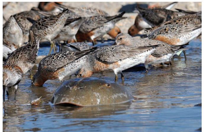
Red Knots feeding on horseshoe crab eggs in Delaware Bay.

To be assured of seeing a "patch", "fling", or "tangle" of Red Knots, take a trip to Delaware Bay, or visit Morecambe Bay on the west coast of England. You may want to see them on The Wash in eastern England too. Perhaps Queensland appeals to you more. If you spend a long day watching Red Knots there, you could enjoy a bottle of "good cheap wine" called Red Knot cabernet sauvignon.