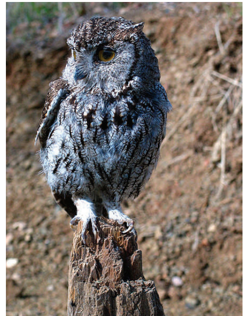
Western Screech Owl

In October, a Song Sparrow returned to the same patch of Labrador Tea, singing to himself deep within the bushes. He spends the winter shuffling back and forth under my pine trees. In November, Robins visited in large flocks, cleaning out the last of the huckleberries and are now gone. My naked willow is on a regular gleaning route for the Chickadees, Bewick's Wren and Ruby Crowned Kinglets. The Hermit Thrush claims the lawn furniture for itself and dines on the red berries from my Christmas swag. I love watching the brilliant faces of the Townsend's Warblers feeding in the sunshine at the tips of the cyprus branches. The female Wren Tit can still be heard proclaiming her territory. The long-mated raven pair spend more time in the snag, gleaning each other. Hairy and Pileated Woodpeckers regularly inspect the dead trees. Now the Red Crossbills travel in pairs and sing their beautiful courtship songs. Our mornings are so early that I even hear the Screech-Owl. sing when I awake.