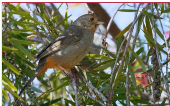
California Towhee