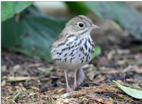
Ovenbird