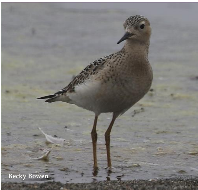
Becky Bowen Buff-breasted Sandpiper, August 20, 2016 Ten Mile Beach

And did the Buff-breasted Sandpipers ever return? Between 2007 and 2016, surveyors recorded a total of 27 sightings of the bird, way off a migration course down the central states (almost never on the Pacific or Atlantic Coast). The latest sighting was in August at Ten Mile.